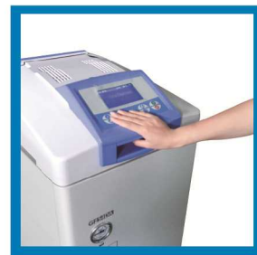
Inter lock sensor