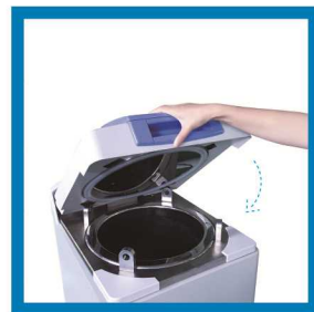
Press the lid

Unique opening way, more convenient than traditional vacuum suction way. One touch automatic open and close for GFA series