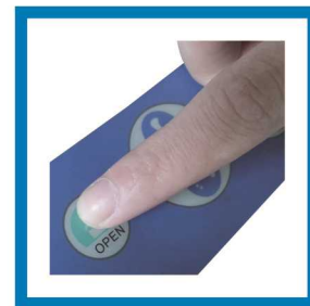
One touch open